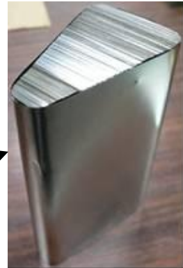
Fig. 2. Stratified amorphous metal core