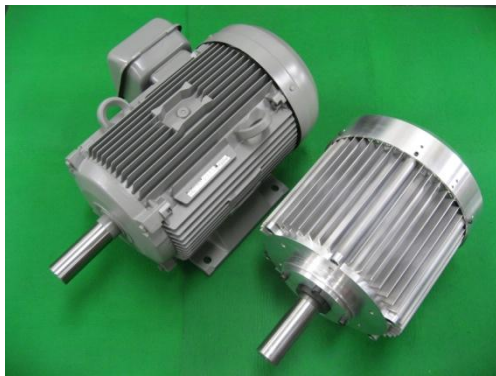
Fig. 3. Comparison of motor size

Left: Conventional industrial 11kW induction motor Right: New motor developed