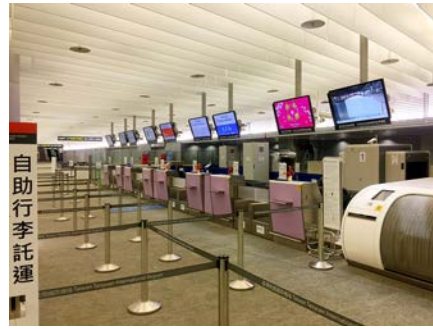
In-town check-in counters