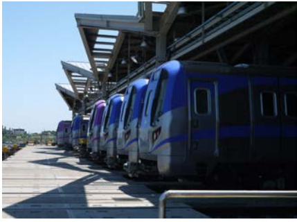
EMU (Electric Multiple Unit)