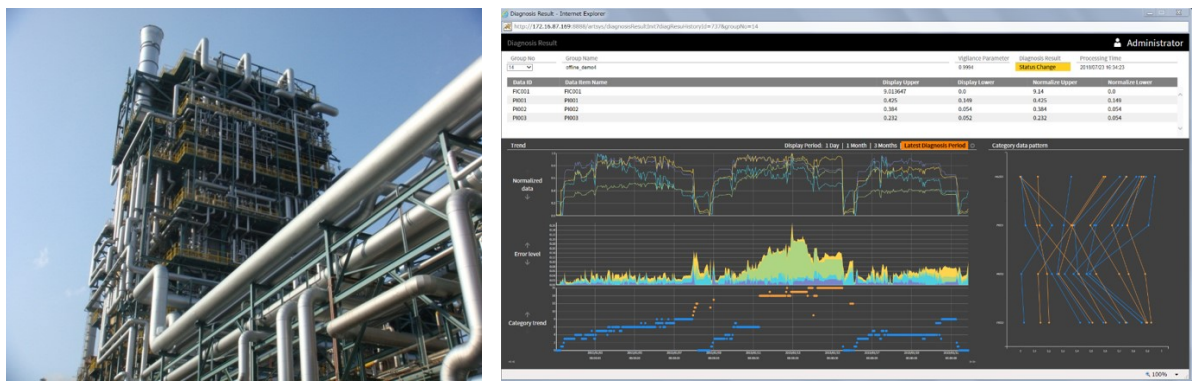
Left: Exterior view of the decomposition furnace in the ethylene plant of Showa Denko Right: Screen of the monitoring system

Commercialized after Joint Demonstration Experiment at Showa Denko's Ethylene Plant to Help Improve Efficiency in the Operation and Maintenance of the Whole Plant