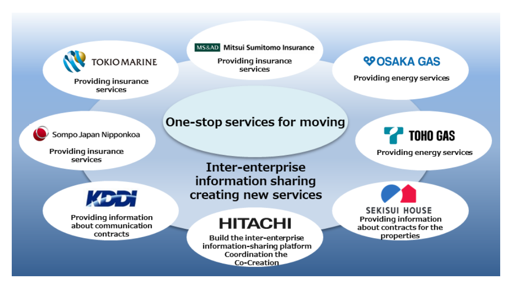
<Respective Roles of Companies in the Collaborative Creation>