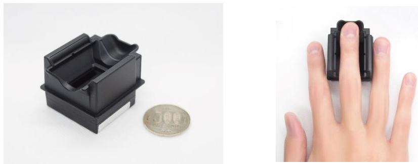
H4E series compact finger vein authentication module exterior (left) and example of the usage (right)

Designed for doors, safes, attendance management, FA equipment and more across a wide range of industries, with ease of use in various environments and support for the "New Normal" through antibacterial coating