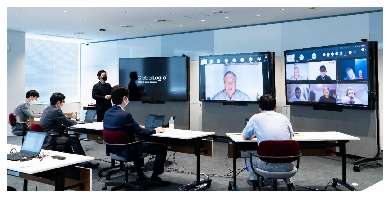
A workshop connecting "Lumada Innovation Hub Tokyo" and GlobalLogic's Design and Engineering Centers

Company to Provide DX Services in the Japanese Market, Combining Lumada's Capabilities