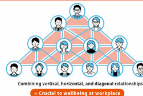
Triangular Relationships Essential for Wellbeing in an Organization

Since organizations tend to have V-shaped or vertical relationships with people, we use digital technology to help establish the triangular relationships that lead to the creation of happy and productive groups. Facilitated by smartphone or PC apps, people are put into groups of three each week in