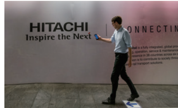
Transport Using the Smartphone App GoGoGe

Through its Social Innovation principle, Hitachi Rail tries daily to deliver value to all the communities we are proudly part of.