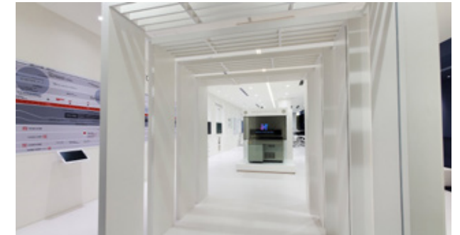
Healthcare Innovation Center Tokyo

Through our work on measurement and analysis systems in the biomedical and life sciences, we contribute to accurate and reliable in-vitro diagnostics. In the field of clinical chemistry and immunological blood testing, in particular, Hitachi High-Tech analytical systems are used to conduct approximately 20 billion tests per year, supporting the advancement of diagnosis and therapy planning around the world. With regard to new in-vitro diagnostics, we have invested in U.S. company Invivoscribe, Inc., a global provider of testing services mainly for blood cancers, and have begun collaborating to advance molecular diagnostics. This collaboration will enable us to contribute to the early detection of cancer, therapy planning, and drug development by pharmaceutical companies, leading to healthier and safer societies.