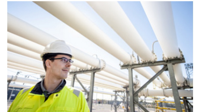
EconIQ of Hitachi Energy

SF 6 -free portfolio across the entire high-voltage switchgear range, demonstrating the scalability of the portfolio and strengthening the company's position as a sustainable technology leader within the industry.