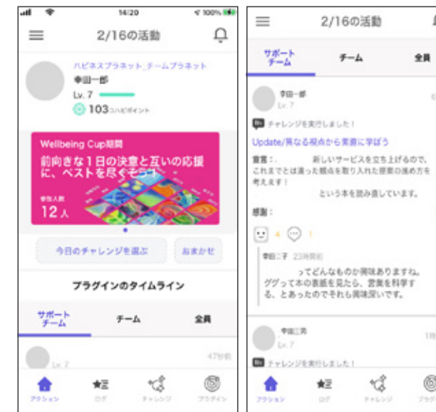
Smartphone App Screenshot

Since organizations tend to have V-shaped or vertical relationships with people, we use digital technology to help establish the triangular relationships that lead to the creation of happy and productive groups. Facilitated by smartphone or PC apps, people are put into groups of three each week in